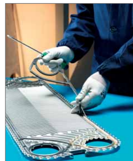
2. Removing old gaskets