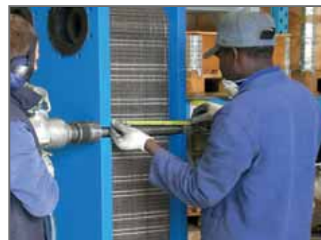
Disassembly and check