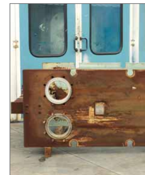
7. Detail of a frame requiring sanding and painting