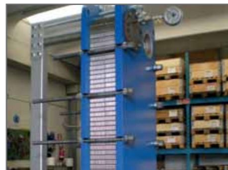
Testing the seal on the refurbished exchanger