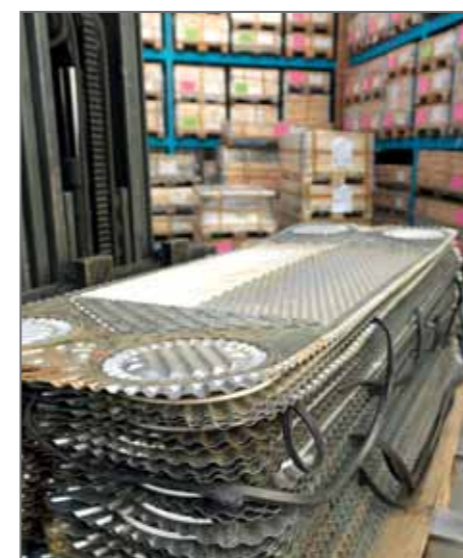
1. Receiving and inspecting the plates