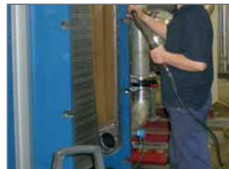
Cleaning of the plate pack in situ