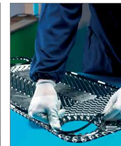
9. Glue-free gasket attachment