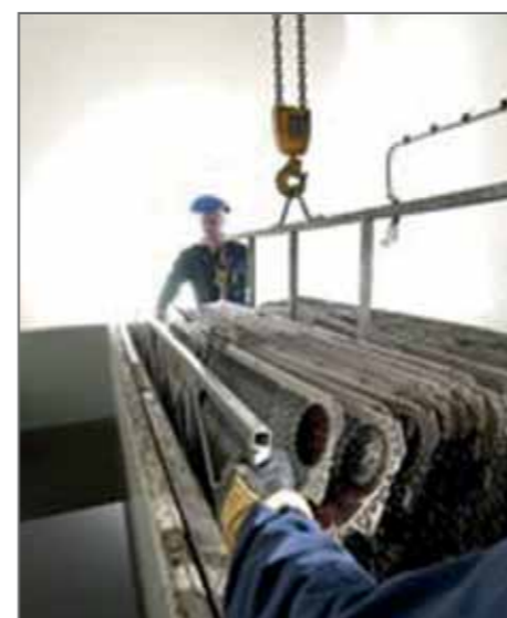
3. Chemical immersion and pickling