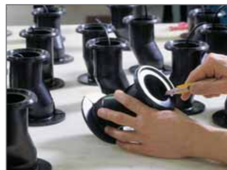
Some of the gasket deburring steps