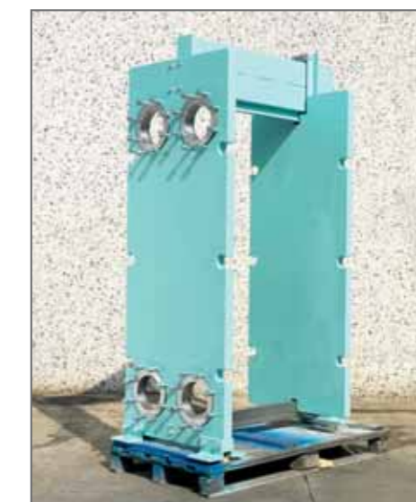
8. Sanded and painted frame