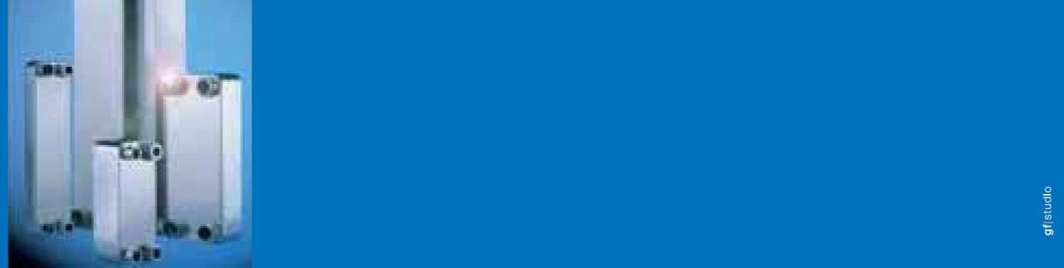
Plate heat exchangers

RM Service supplies complete plate heat exchangers of any size, with titanium and steel plates and gaskets made of any material. Starting from the process data, our technical department will develop and design the most suitable exchanger to fulfil your every application need.