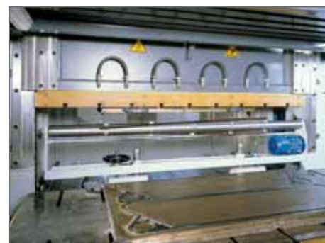
Gasket compression moulding

BS - IDF regulation industrial fittings.